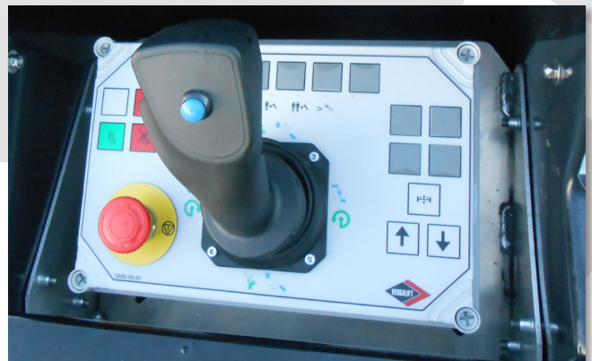
Upper controls: Single joystick