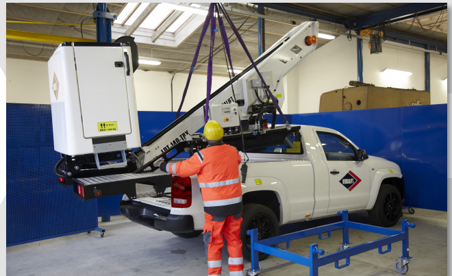
Max 15 min equipment change with overhead crane or forklift truck