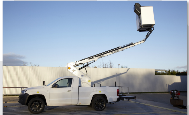
VW Amarok FWD Pickup truck