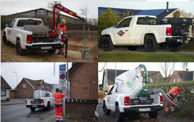
Quick Shift options: Crane, salt spreader, pressure washer, leaf suction unit etc.