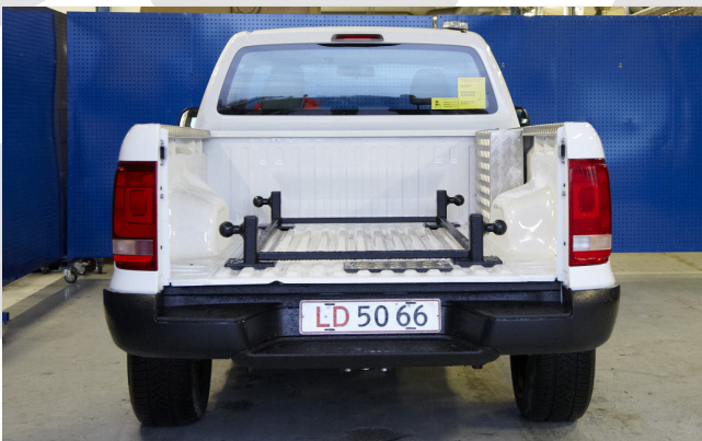
Mounting frame on cargo bay. Attach equipment at four connection points