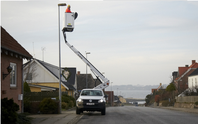
Compact operating dimensions (Patented Axle locking system - no outriggers)