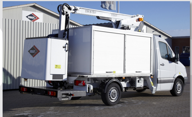
2 man Eco cage with door, flash and electrical outlet