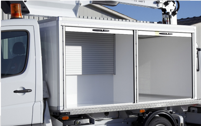
TIME Smartbox on chassis with 4 manually opened vertical doors