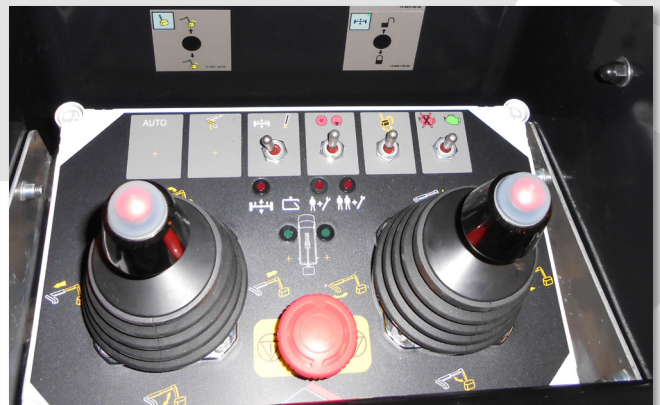
IPC: Dual inlet controls with 2 joysticks