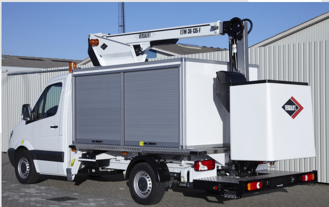
Shortened rear platform with flash